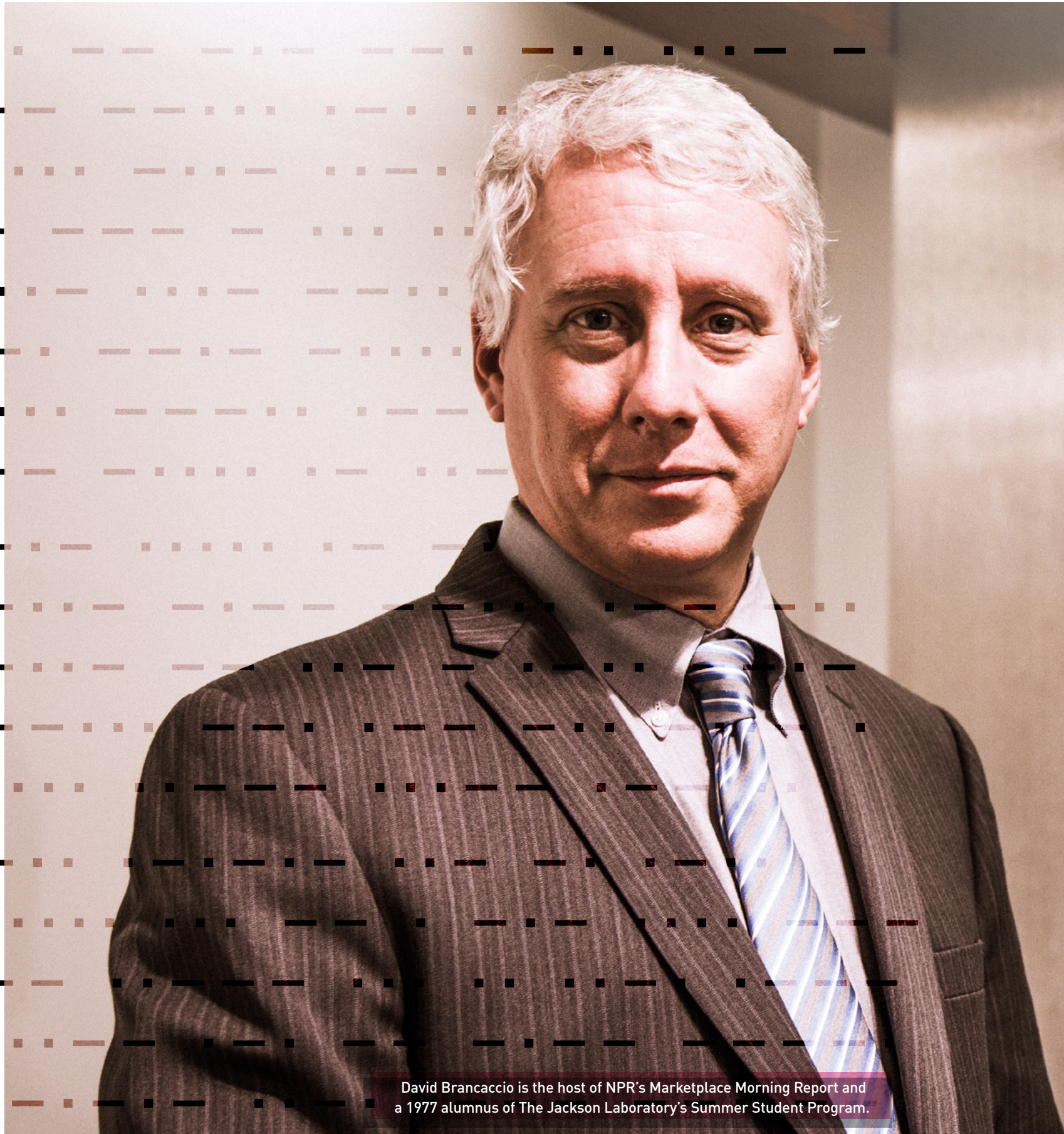
David Brancaccio is the host of NPR's Marketplace Morning Report and a 1977 alumnus of The Jackson Laboratory's Summer Student Program.